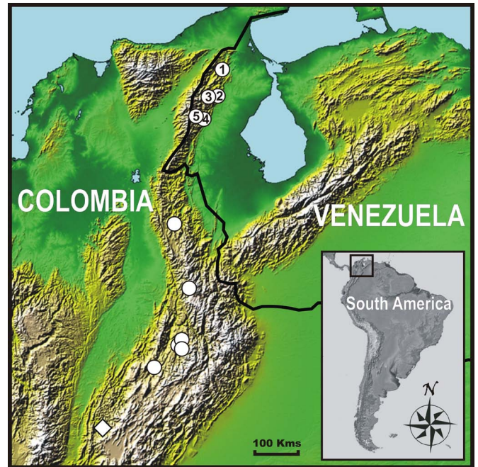
FIGURE 3. Geographic distribution map of Centrolene daidaleum . Dots numbered from 1-5: New locality records from the Sierra de Perijá, Venezuela. 1. Quebrada El Gocho, Fundo El Progreso, Río Socuy upper basin; 2. Creek near base camp of the Cerro Las Antenas, Río Lajas basin; 3. Creek near last antenna, cerro Las Antenas, Río Lajas basin; 4. Indigenous community of Manastara, Río Negro basin; 5. Río Tétari Kopejoacha, Campamento Guacharaca, Río Negro basin. White dots: localities recorded from Colombia (Ruiz-Carranza and Lynch 1991; Rada et al. 2007; Rada and Guayasamin 2008; Daza and Barrientos 2005). White rhomb: type locality (Ruiz-Carranza and Lynch 1991).

Centrolene daidaleum has been recorded in Colombia from streams in premontane forest, cloud forest, and even secondary forest on the western slope of Cordillera Oriental (Ardila-Robayo and Rueda 2004). The five new Venezuelan localities are also in premontane, montane and cloud forests. Almost all small rivers were surrounded