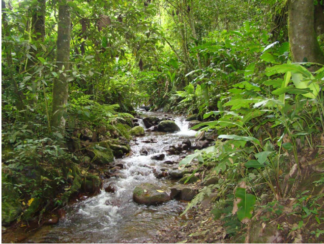
FIGURE 4. Habitat where Centrolene daidaleum was found at Campamento Guacharaca, Río Tétari Kopejoacha, Sierra de Perijá, Venezuela.

However, the new localities in the Venezuelan Sierra de Perijá significantly increase its distribution, indicating that the species has an extent of occurrence much wider than previously known. Two Venezuelan populations (Manastara and Campamento Guacharaca) occur inside the Parque Nacional Sierra de Perijá. A reassessment of the conservation status of the species is required in order to include new data.