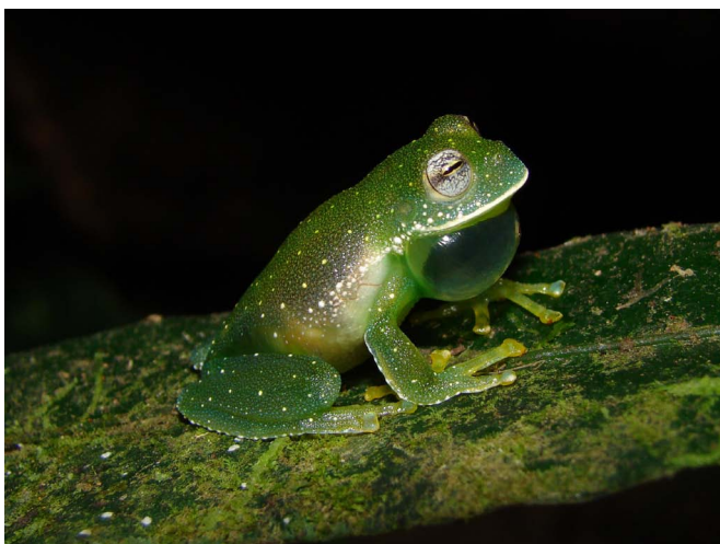
FIGURE 1. Lateral view of an adult male of Centrolene daidaleum from the Sierra de Perijá, Venezuela.

Centrolene daidaleum is considered endemic to the Cordillera Oriental of the Colombian Andes, and known only from eight localities between 1,600 and 2,060 m (Figure 3). The type-locality of the species is: Granja Infantil del Padre Luna, Vereda Las Marías, municipio de Albán, departamento de Cundinamarca, western slope of the Andean Cordillera Oriental, Colombia, at 2,060 m (Figure