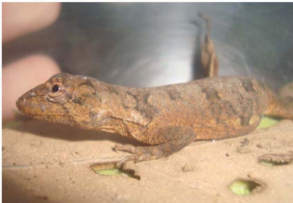
Figure 3. Adult male U. vautieri (CRLZ 000065) collected at Reserva do Boqueirão , municipality of Ingaí, state of Minas Gerais.