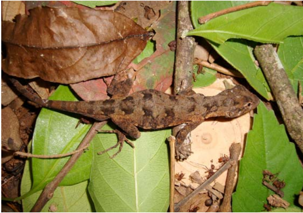
Figure 2. Adult male U. vautieri (CRLZ 000065) collected at Reserva do Boqueirão , municipality of Ingaí, state of Minas Gerais.