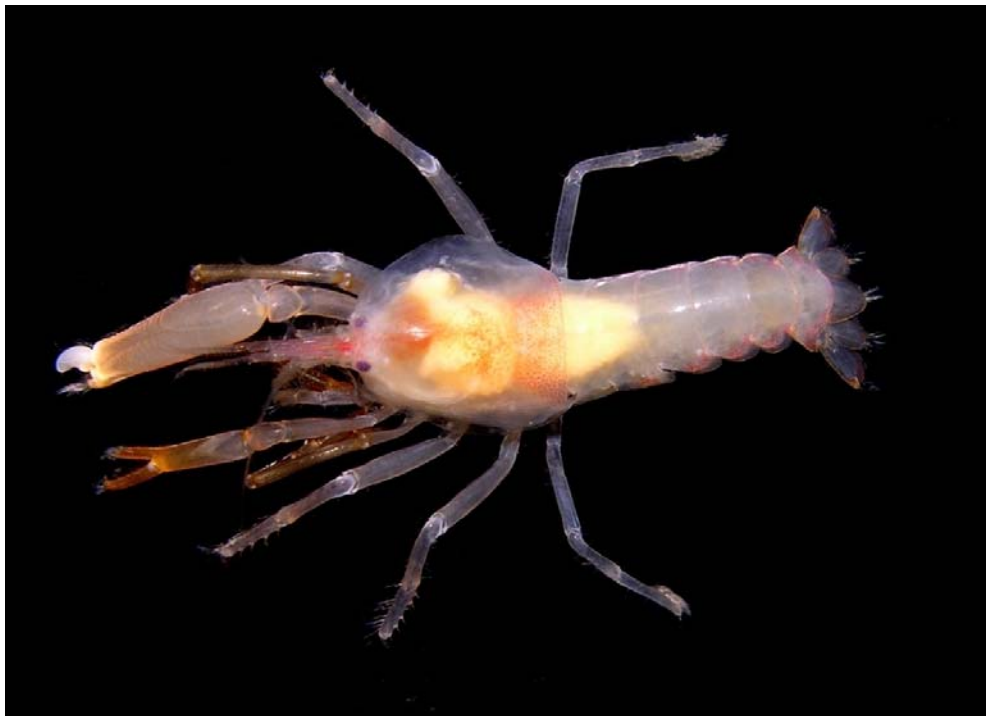
Figure 3. Alpheus simus Guérin-Méneville, 1856, male in dorsal view from Isla Grande, Caribbean coast of Panama.

Remarks: The membranous carapace of the specimen is partially damaged, precluding the drawing of the frontal region. The minor chela and the right second pereopod are also missing. However, the main diagnostic features of A. simus are readily recognized in our specimen, such as the absence of a rostrum, the emarginated front, and the typical hammer-shaped dactylus of the major chela (Figure 2A). The dorsal region of the telson is free of spines; the distolateral angles are each armed with one small subdistal spine; the posterior margin bears three pairs of spines of different length (the submedian pair is the largest and the most-lateral the shortest) in addition to several setae. The propodus of the third and fourth pereopods has three strong single movable spines, in addition to a distal pair of spines, close to dactylus. The distal pair is also present in the fifth pereopod, but only two weaker single movable spines are present on the propodus (Figure 2D, F, H).