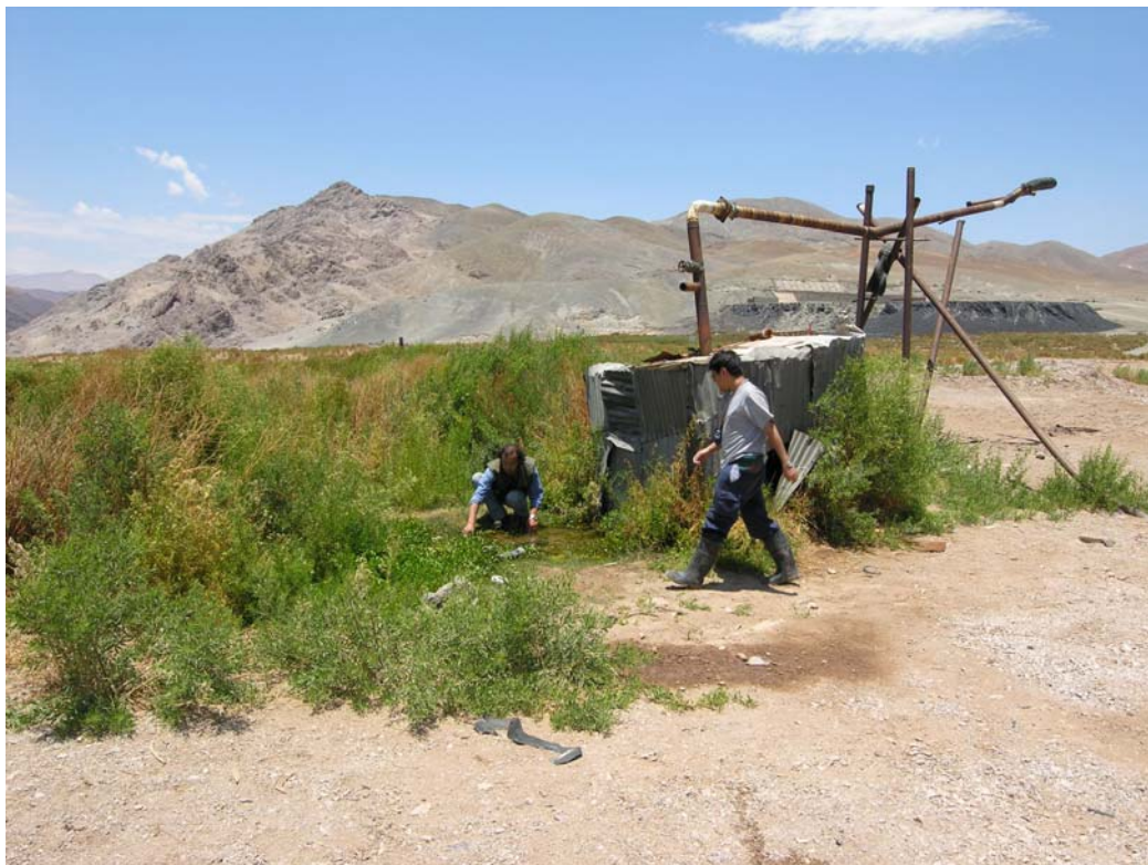
Figure 3. Sampling site in Carrera Pinto oasis, showing the exact place where water springs up. Two authors, C. L. Correa (walking) and E. R. Soto, appears in this photography.