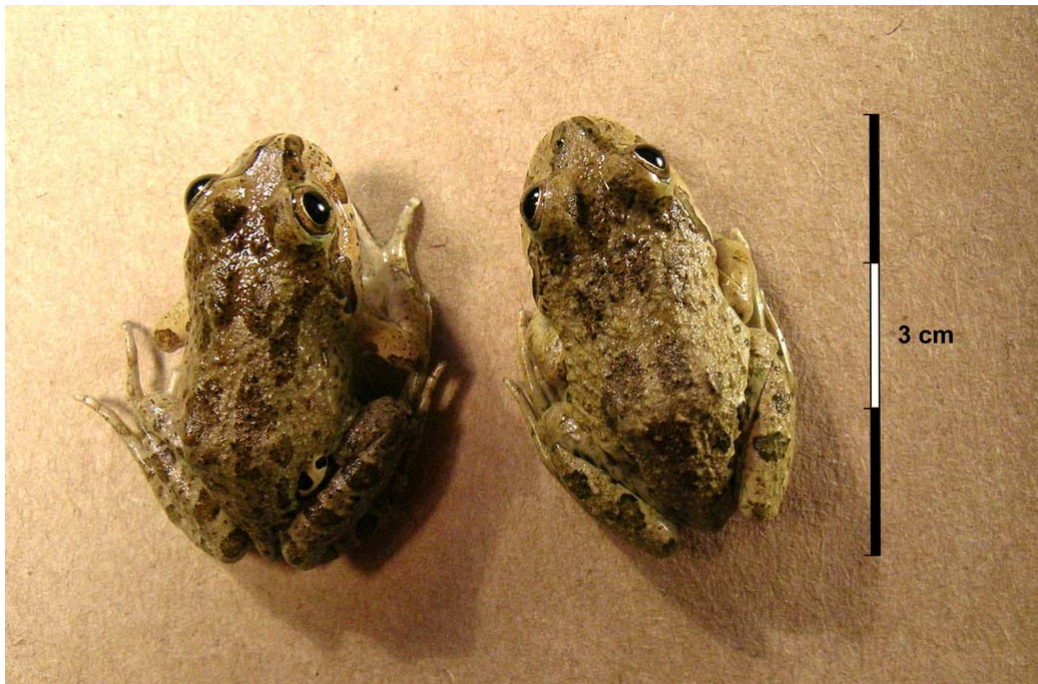
Figure 2. Subadult specimens of Pleurodema thaul from the locality of Carrera Pinto.