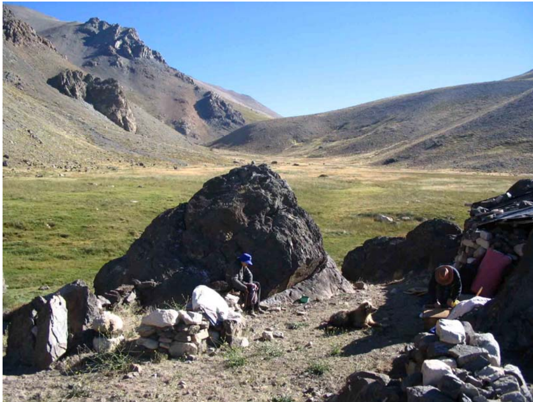
Figure 4. Panoramic view of the locality of Vega Piuquenes.