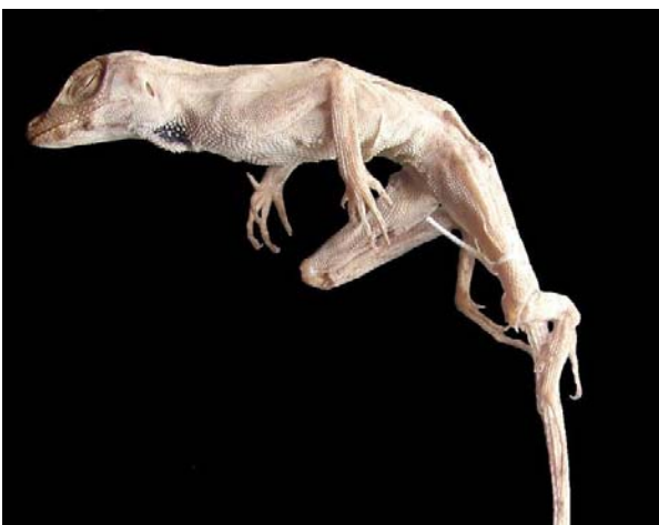
Figure 1. Lateral view of Anolis nitens tandai (LPHA 1879) from Parauá, municipality of Santarém, State of Pará, Brazil.

Anolis nitens tandai Ávila-Pires, 1995 is a diurnal lizard, frequently found on leaf litter of the humid tropical rainforests from Central and Occidental Amazon, in the states of Acre and Amazonas, Brazil (Ávila-Pires 1995; Vitt et al. 2001). On 12 October 2001 at 09:20 h, we collected one specimen of A. nitens tandai (Figure 1) in Parauá (02°50'38" S, 55°10'54" W), municipality of Santarém, State of Pará, Brazil. The individual was observed on the ground in a gallery forest, and it was captured in a shrub 25 cm high.