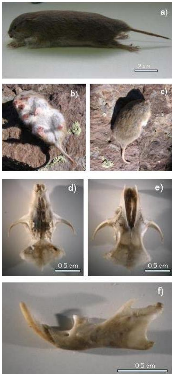
Figure 2. Young female of Notiomys edwardsii collected in Laguna Blanca, Somuncurá plateau, province of Río Negro, Argentina. a) voucher skin, b) ventral view, c) dorsal view, d), e), and f) ventral and dorsal view of skull and mandible of a specimen of Notiomys edwardsii recovered from owl pellets remains.

The scarce collecting localities, mainly in central Patagonia, become Notiomys edwardsii in one of the less known sigmodontinae rodents from the vast territory of Argentine Patagonia. The fragmented distribution, added to the monotypic condition, allowed to consider it as a "rare" species and to be incorporated as vulnerable in the red list of Argentinean mammals. These new record localities, and the high abundance of Notiomys edwardsii in some of the owl pellet samples, will lead to reconsideration of the conservation status of this species in the future.