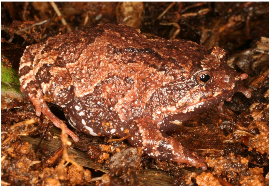
Figure 1. Zachaenus carvalhoi from Parque Nacional do Caparaó, state of Espírito Santo, Brazil.

among leaves on the humid forest floor, from which terrestrial endotrophic tadpoles hatch (Lutz 1944; van Sluys et al. 2001). Zachaenus carvalhoi , on the other hand, is poorly known and restricted to the type locality, in municipality of Santa Tereza (ca. 800 m elev.), state of Espírito Santo, and municipality of Pedra Dourada (ca. 630 m elevation), state of Minas Gerais (Dayrell et al. 2006). The species is classified under the "Data Deficient" category of IUCN due to the lack of information on its occurrence and ecological requirements (IUCN 2008).