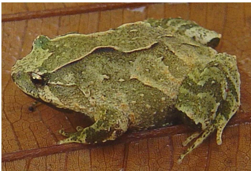
Figure 2. Zachaenus parvulus from Reserva Biológica Poço das Antas , state of Rio de Janeiro, Brazil.

While collecting at the Parque Nacional do Caparaó (permit number 030/2005–CGFAU/LIC) we were fortunate to find three specimens of Z. carvalhoi at the state of Espírito Santo, municipality of Ibitirama, district of Santa Marta, Fazenda Pico da Bandeira, Córrego do Calçado (20°28'02" S, 41°44'02" W; elevation 1135 m; datum: WGS 84; GPS Magellan MAP-330) in two different occasions. These specimens are deposited at the Museu de Zoologia da Universidade de São Paulo (MZUSP 139102, field number MTR 12613; MZUSP 140431–140432, field numbers MTR 15805–15806), and were collected using small pitfall traps made of plastic cups buried into the forest floor in October 31, 2006, and found on the forest floor by active search on 4 November 2008. The months of collection of exemplars are congruent to those when specimens were obtained at Santa Teresa: March, April, August, October, and November (Izecksohn 1983). The specimens collected in 2008 were vocalizing around 10:00 h during a downpour. The frogs were hidden under the leaf-litter, and called intensively during the rainstorm, but very sporadically when the rain decreased or ceased. Their advertisement call was not recorded.