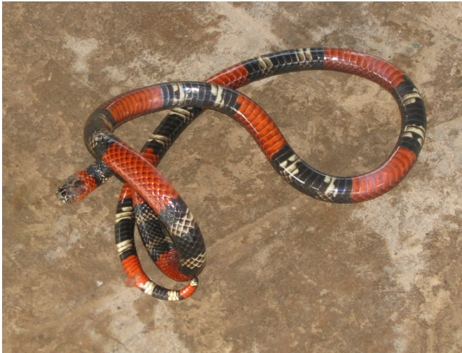
FIGURE 2. Dorsal and ventral view of specimen of M. silviae recorded in Paraguay; note partially everted right hemipenis.

respect to the Figure 2 of the original description, two last supralabials are red (gray in the picture), and white gulars, as our specimen (Figure 3). According to Di Bernardo et al. (2007) there are four species of coral snakes with the middle black ring wider than the external ones in each triad: M. pyrrhocryptus , Micrurus tricolor (Hoge, 1956), M.