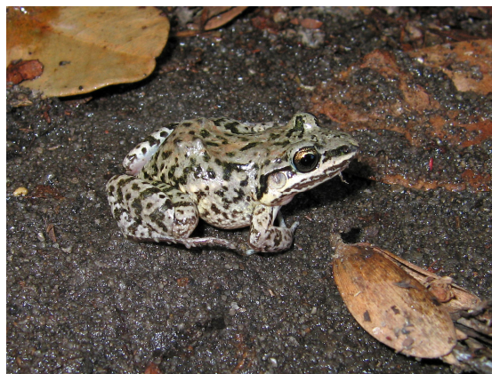
Figure 1. Leptodactylus caatingae , MNRJ40825, at municipality of São João do Cariri, state of Paraíba, Brazil.

Brazil. Individuals of L. caatingae (Figure 1) were found in these temporary ponds and identified based on the original description. The specimens were deposited in the Museu Nacional do Rio de Janeiro (MNRJ40825, MNRJ40826, MNRJ40827) and in the Coleção Herpetológica do Departamento de Sistemática e Ecologia da Universidade Federal da Paraíba (UFPB 4310 – 4314), Brazil.