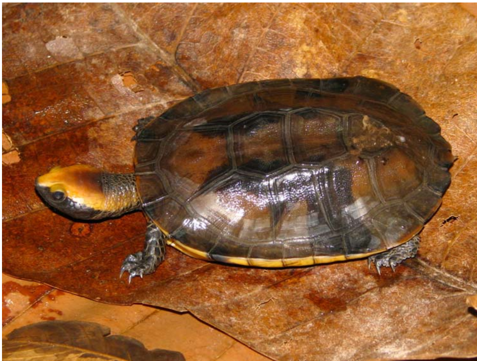
Figure 1. Specimen of Platemys platycephala platycephala (MZUFV 47) from municipality of Aripuanã, state of Mato Grosso, Brazil.

At present, there is only one record of Platemys p. platycephala in state of Mato Grosso, Brazil, from Culuene river (Ernst 1983; Pritchard and Trebbau 1984; Iverson 1992), a tributary of the Xingu river, located in eastern Mato Grosso.