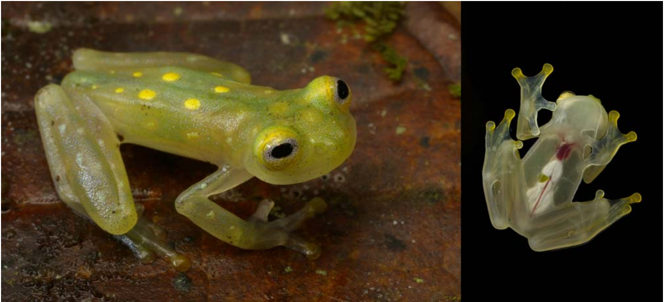
Figure 4. Dorsal and ventral views of Hyalinobatrachium aureoguttatum (QCAZ 32068).