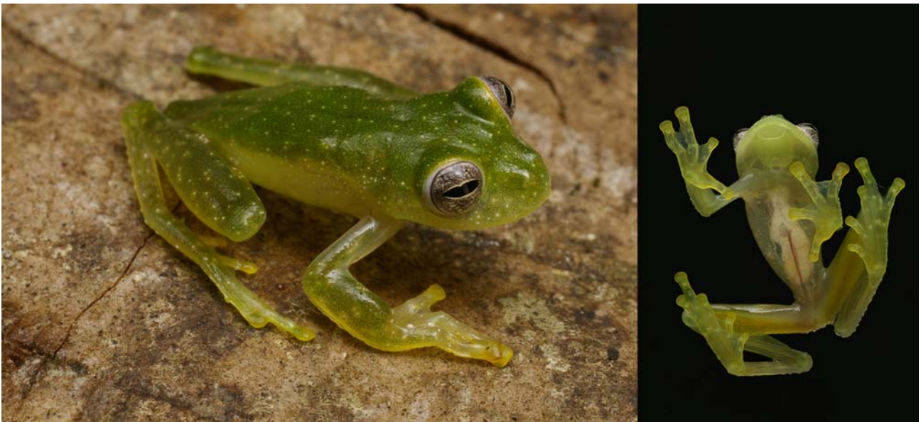
Figure 2. Dorsal and ventral views of Cochranella pulverata (QCAZ 32224).

Cochranella pulverata is distinguished from other Glassfrogs by the following characters: (1) lime green dorsum with small yellow-white spots; (2) light green bones; (3) venter completely transparent with white heart, liver, and digestive tract; (4) snout truncate from above and obtuse in profile; (5) indistinct tympanum; (6) SVL 22–29 mm in adult males and 23–33 mm in adult females and (7) webbing formula between outmost fingers: II 1 ½– 3 III 1 ½–1 ¼ IV (Savage 2002) (Figure 2).