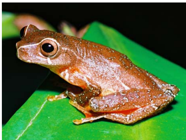
Figure 1. Adult specimen of Dendropsophus ruschii from Pedra Azul, Domingos Martins, Espírito Santo state, Brazil. CFBH 10584.

Ruschi's treefrog, Dendropsophus ruschii (Figure 1), is a species endemic to the Atlantic Rainforest in the Espírito Santo state, southeastern Brazil. All known specimens were collected in this forest formation, at elevations around 800 m (Weygoldt and Peixoto 1987; Frost 2004).