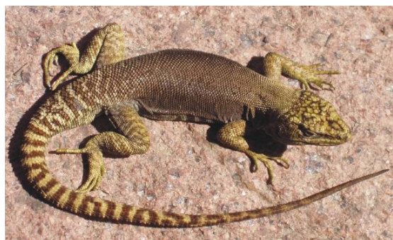
Figure 1. An adult male of Liolaemus petrophilus from central Chubut, Argentina.

carried out between 1998 and 2006 to Chubut and Rio Negro provinces resulted in the collection of a considerable number of samples of Liolaemus petrophilus . Those samples fill distributional gaps and four of them represent significant new geographic records for the species.