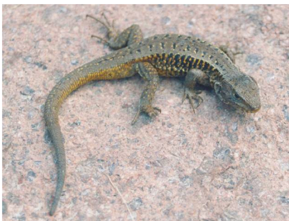
Figure 3. An adult male of Liolaemus pictus from Neuquén, Argentina.

National Parks was made by Christie (1984) but without any reference to voucher specimens. Cei (1986) stated that the species is present in andean forest of Neuquén, Rio Negro and Chubut provinces mentioning the possibility that its distribution follow the remnants of Nothofagus forest south to Buenos Aires Lake in Santa Cruz province. However, in its distribution map only the localities in southwestern Rio Negro province (Nahuel Huapi Lake and El Bolsón region) and around Buenos Aires Lake are marked without any locality in western Chubut. Christie (1984) stated that Liolaemus pictus argentinus is the only woodland lizard found south of Nahuel Huapi Lake. After several field trips, we did not found any Liolaemus pictus population around Buenos Aires Lake, and suitable habitats are scarce at least in this Argentinean region. In the Chilean region, Liolaemus pictus subspecies are not known south of 43° S (Vidal et al., 2006) and recent surveys in the Aysen region (at the same latitude of Buenos Aires Lake) did not register this species (P. Victoriano, pers. com.).