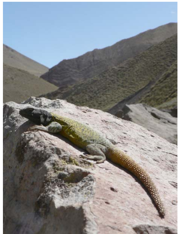
Figure 1. An adult male of Phymaturus verdugo from southern Mendoza, Argentina.

During field trips carried out in southern Mendoza and Neuquén provinces we collected individuals that are morphologically similar to the species described as P. verdugo . Here we present new geographic distribution data for this species that extends significantly its known distribution.