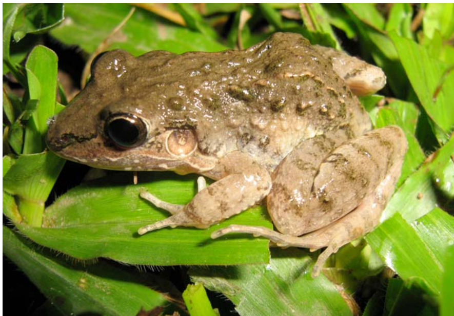
Figure 1. Specimen of Leptodactylus fragilis from Caloto, Vereda Morales, Cauca, Colombia.