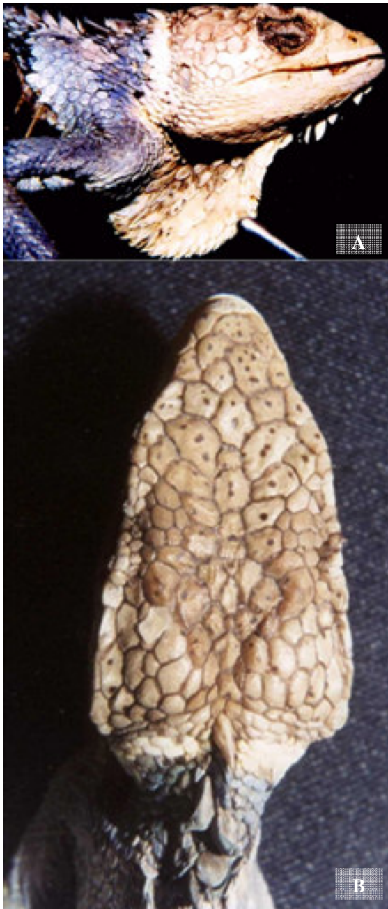
Figure 2. A) Polychrus peruvianus ♂ DHMECN 01762, lateral view of head; and B) dorsal view of head.