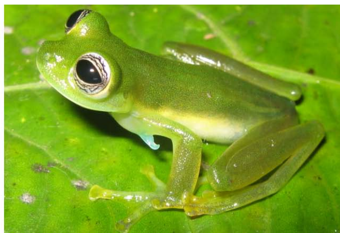
FIGURE 2. Adult males of Sachatamia ilex (left) and Espadarana callistomma (right) not collected. Reserva Forestal San Cipriano-Escalerete, Valle del Cauca, Colombia. Note the exposed humeral spine of E. callistomma , and the concealed humeral spine of S. ilex , embedded in the arm muscles.