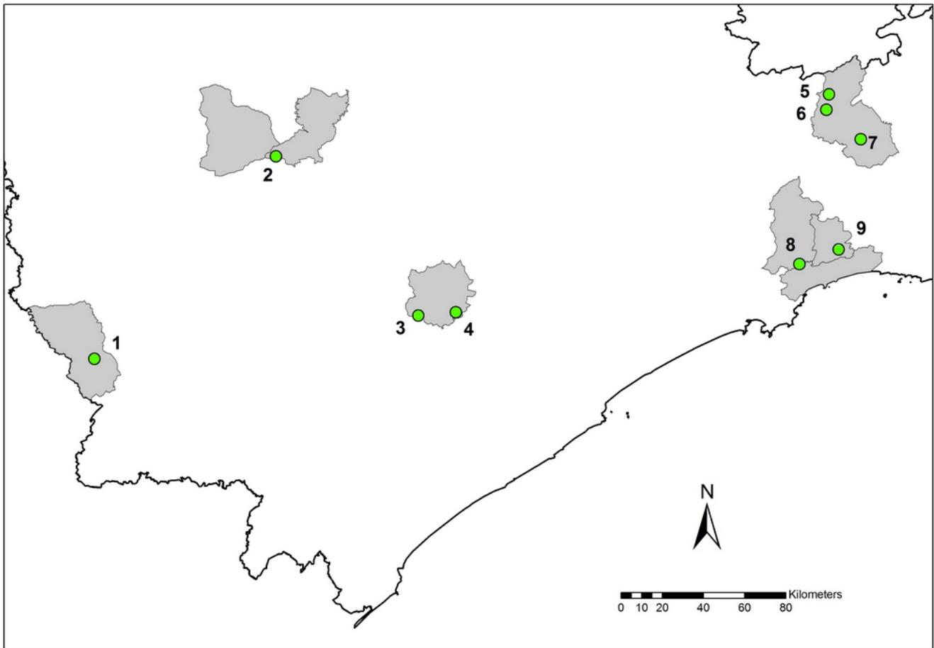
FIGURE 1. Map of the study area in the state of São Paulo, Brazil: 1. Santana Farm; 2. Entrerios Farm; 3. Brumado II Farm; 4. Vitória Farm; 5. Cinco Nascentes Farm; 6. Montes Claros Farm; 7. Central area of São José dos Campos; 8. Parque das Neblinas; 9. Capanhão Farm.

currently dwindling (Machado 2009a). On November 4th 2010, an audio record of the buffy-fronted seedeater was made at BF. On April 8th 2011, an individual was seen and its call was recorded (WA326810) while it moved through a grassland at BF. In the southern state of São Paulo, in the Serra de Paranapiacaba, bamboo flowerings attract many S. frontalis to areas where they were totally absent (Simões 2010). The species was previously recorded in some localities of the Serra de Paranapiacaba. In 1998, it was also recorded at Parque Estadual Intervales (PEI) (Willis and Oniki 2003), which is located in the municipalities of Guapiara, Ribeirão Grande, Sete Barras, Eldorado and Iporanga. In 2009 it was recorded at Parque Estadual Turístico do Alto Ribeira (PETAR), which is located in the municipalities of Apiaí and Iporanga (Antunes and Eston 2010). D. Bucci recently published a photo of a specimen taken at PEI (in the municipality of Ribeirão Grande) ( http://www.wikiaves.com/503983 ). In São Miguel Arcanjo municipality it was recorded at the Parque Estadual Carlos Botelho (PECB) (CEO 2012; Antunes et al. 2013). Recent records were gathered by D. Bete, in the Tapiraí municipality ( http://www.wikiaves.com/766712 ), and by D. Duarte, in the Piedade municipality ( http://www.wikiaves.com/665761 ). Our record is the first record of S. frontalis for the municipality Pilar do Sul.