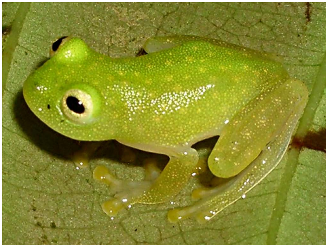
FIGURE 1. Adult male (UFMT 7078) of Hyalinobatrachium carlesvilai collected at the municipality of Aripuanã, state of Mato Grosso, Brazil.

During environmental impact studies and faunal monitoring programs conducted in areas under the impact of the Faxinal II hydroelectric power plant (PCH Faxinal II; 10°09' S, 59°27' W), municipality of Aripuanã, northern state of Mato Grosso, Brazil, we collected one individual of Hyalinobatrachium carlesvilai (UFMT 7078, zoological collection of Universidade Federal do Mato Grosso; Figure 1). This frog was found on 04 November 2006 while calling