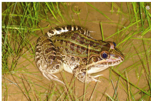
Figure 2. A, Leptodactylus chaquensis (see details of the double vocal sac and the brownish dorsal coloration); B, Leptodactylus ocellatus . Both from the municipality of São Sepé, Serra do Sudeste region, state of Rio Grande do Sul, Brazil.