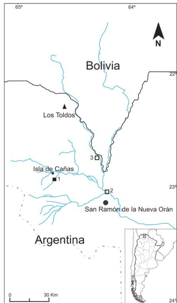
Figure 1. Distribution map showing type locality (black triangle) and new distribution records (squares) of E. skotogaster : (1) voucher specimen (MLP.A. 4900) locality, near to Isla de Cañas; visual and auditory detection near to Río Piedras (2) and to Aguas Blancas (3).

Adult calling males and one metamorphic specimen of E. skotogaster were seen or heard in small temporary ponds formed at the margins of the Ruta Nacional number 50, near to the intersection with the Río Piedras (23°4'50" S, 64°19'47" W; 350 m) upstream Aguas Blancas (22°45'17" S, 64°20'47" W; 410 m), both located in Orán department, Salta province, Argentina (Figure 1).