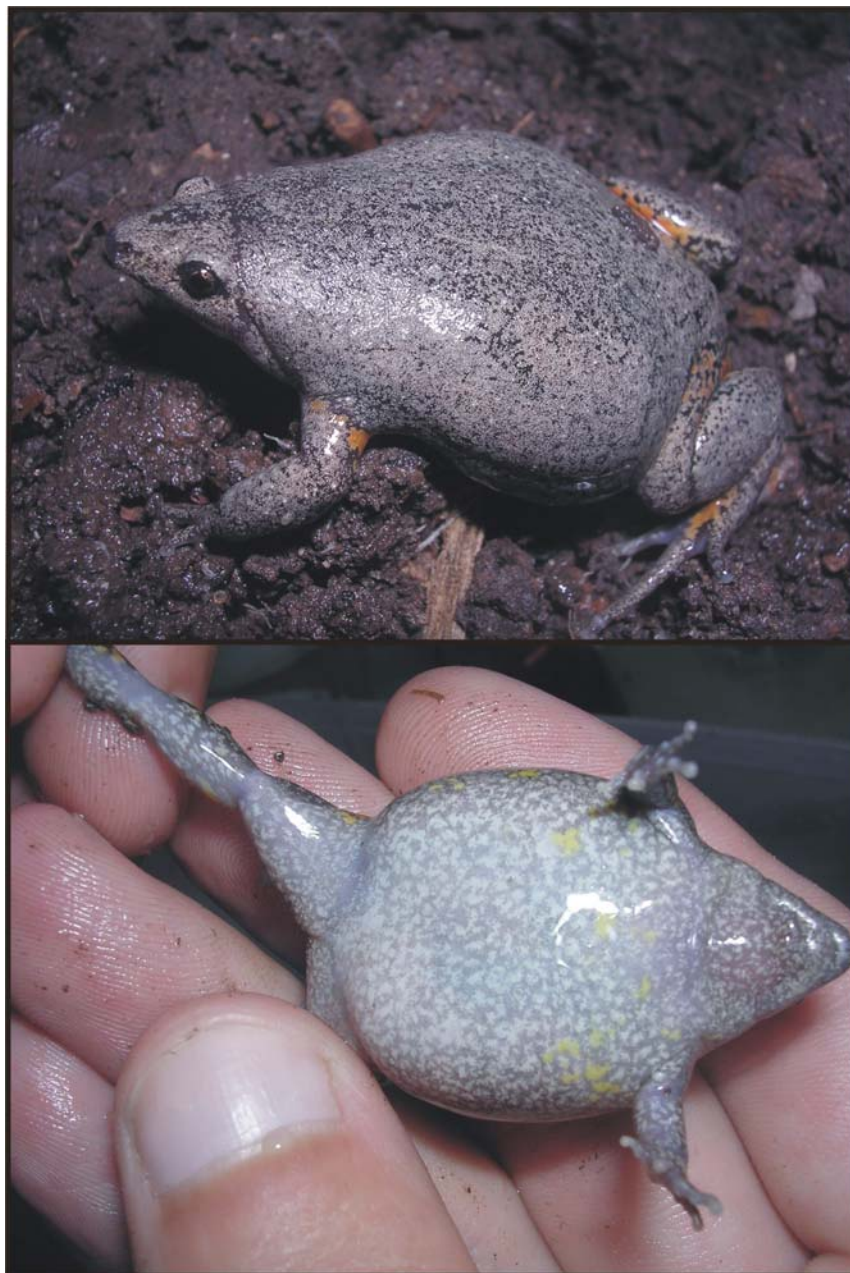
Figure 2. Dorsal and ventral view of an adult female of E. skotogaster (MLP.A.4900) collected near Isla de Cañas, Salta province, Argentina.

of E. skotogaster were disturbed anthropic areas. The specimen (MLP.A.4900) represents the first record of a population of E. skotogaster outside its type locality, and its distribution range is extended 70 km south from Los Toldos. Acoustic and visual reports also extend its distribution 95 km southeast from the type locality, being also the lowest altitudinal record of the species (350 m).