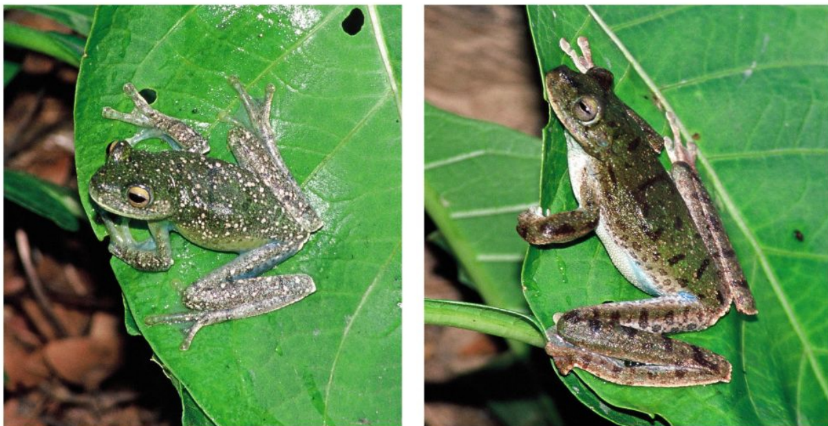
Figure 1. Photo vouchers of adult male (left) and adult female (right) of Hypsiboas pellucens from Quebrada Cochas, at Zona Reservada de Tumbes , departament of Tumbes, Peru.

Hypsiboas pellucens was photographed (Figure 1) and identified by the senior author in a survey at the PTR in the PNCA, at Quebrada Cochas (03°49'18" S, 80°13'54" W; 330 m), province of Zarumilla, department of Tumbes, on 12 December, 2001. A male specimen (MUSM 26198; Figure 2), was collected in a recent survey